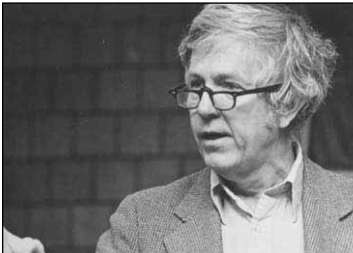
Michael Harrington (1928-1989), DSA founder and author of The Other America, Poverty in the United States .

Real leadership is the art of getting people to cooperate and assume responsibility, and organizing is empowering others to become part of something bigger than themselves that can help them realize collective goals. It is not deceptive, coercive or manipulative and does not serve the aggrandizement of the leader's