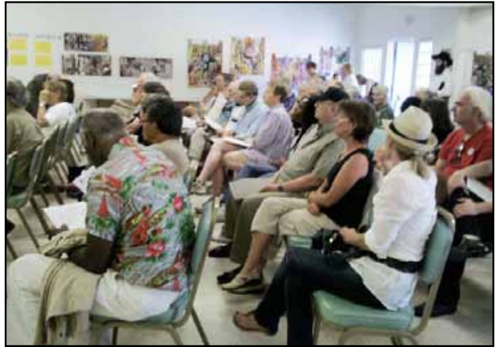
The recently revived Los Angeles DSA local holds its first meeting

The OC should also define its short-term goals, including establishing a local and increasing membership. At this point you'll need a reality check. How many hours can each person in the room give this week? Next week? The week after? ... If a big meeting with an invited speaker is too much work, try a smaller meeting with a DSA video or a letter-writing party. If the main organizer has time now but not ongoing, try setting up a table in a public place to pass out information and have people stop and sign a petition or write a letter about an important local issue (and make sure to collect contact info for anyone interested in learning more about DSA).