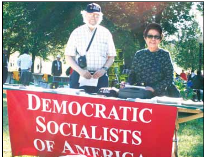
Tabling at the 2010 One Nation rally for jobs in Washington DC.

Tabling (active) Tabling is a great way to reach people, practice talking about democratic socialism, and get new members. Essentially, you set up a table in a public spot, put out some literature and buttons, and talk to